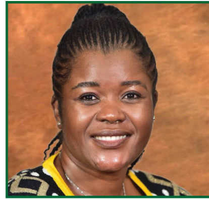
Deputy Chairperson: Dr Nobuhle Nkabane, MP Deputy Minister of Mineral Resources and Energy