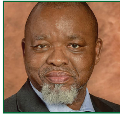
Chairperson: Mr Gwede Mantashe, MP Minister of Mineral Resources and Energy