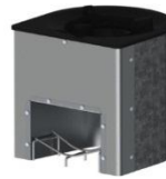
Figure 3: Z3000 Built in Stove

Is the technology one that has been previously tried and tested in South Africa or internationally? If yes, provide details (1 paragraph)