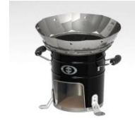
Figure 2: G3300 (Left) and M5000 (Right) Portable Wood Stoves