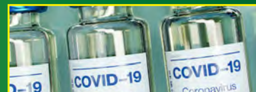
Facts about the Vaccine P10