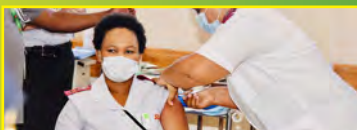
Health Worker Testimony P4