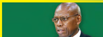
Message from Minister P2