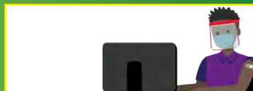
How do I register to get Vaccinated P5